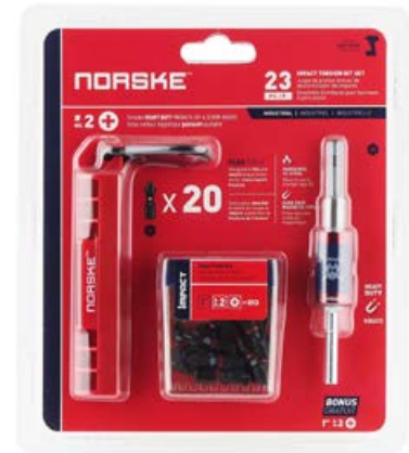
INCLUDES 10PC BIT CLIP AND CARABINER