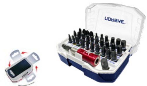
UNIQUE 360° ROTATING BELT CLIP DESIGN