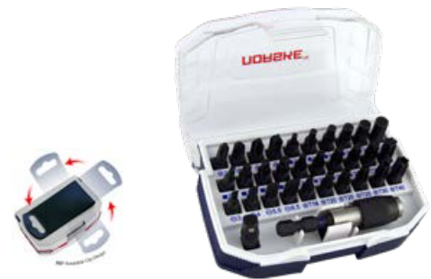
UNIQUE 360° ROTATING BELT CLIP DESIGN