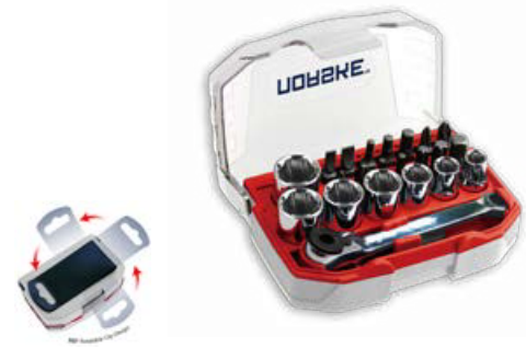
UNIQUE 360° ROTATING BELT CLIP DESIGN